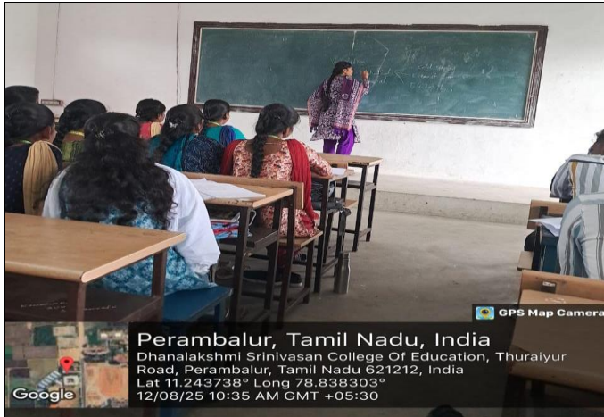
Perambalur, Tamil Nadu, India Dhanalakshmi Srinivasan College Of Education, Thuraiyur Road, Perambalur, Tamil Nadu 621212, India Lat 11.243738° Long 78.838303° 12/08/25 10:35 AM GMT +05:30